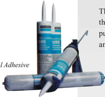
Silicone Structural Adhesive

The flexibility of this system will also increase the ability of the system to cycle due to blast pulse and wind storm energies that create positive and negative pressure effects or by twisting forces associated with earthquakes. In addition, resistance to smash-and-grab and forced-entry impacts can also be improved with the installation of Ultraflex.