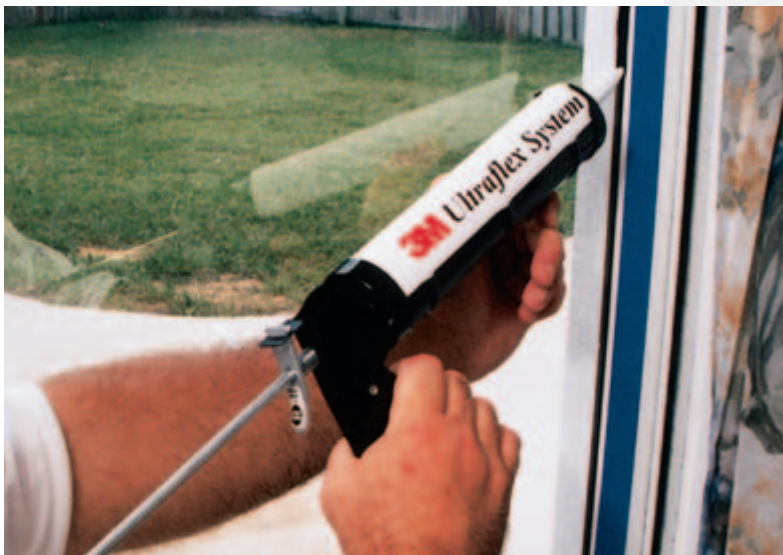
3M™ Ultraflex Window System

3M Ultraflex Window System allows the frame to bend and twist to accommodate a variety of stresses, increasing personal safety from flying glass. For ease of use, the Ultraflex System offers a simple, more cost effective attachment system when compared to more bulky mechanical attachment alternatives. The Ultraflex System will replace the window gasket and blend with the frame system to look as good as the gasket it replaces.